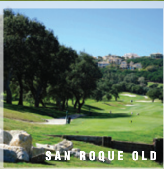
SAN ROQUE OLD